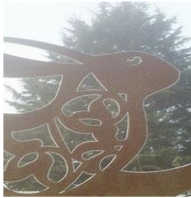
Brick Signage Crossmoor ???