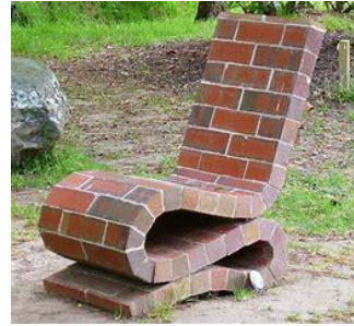
A nod to the Derby Higham Side???