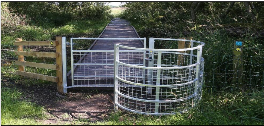
The Kissing Gate on Carrs Green

We wish all the residents of Inskip with Sowerby a happy, healthy and prosperous New Year